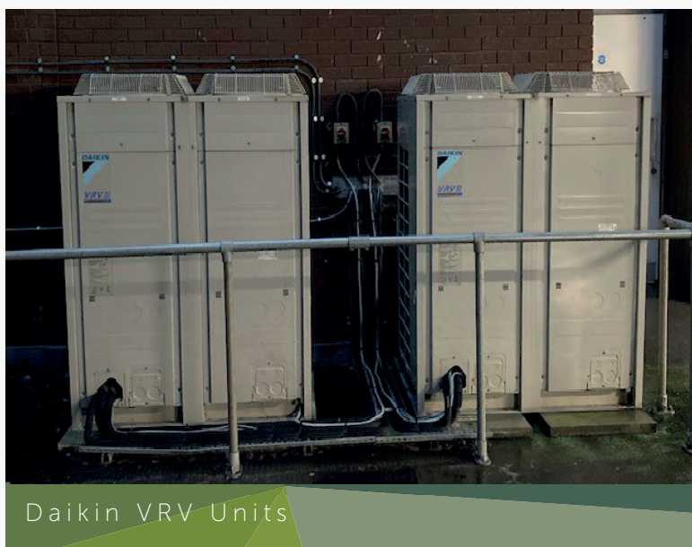
Daikin VRV Units

Birdsall's air conditioning optimisation services incorporate cutting edge software and hardware to undertake these tasks. Our R&D department are constantly evolving our optimisation models and we implement all these new developments in the field to prove their value.